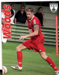
Woods VERSUS KEMPSTON ROVERS Saturday 10th November 2017 Kick-off 3.00pm