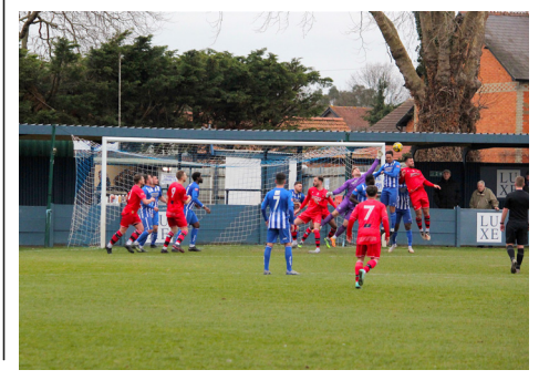
CHERTSEY TOWN 0-1 NORTHWOOD

However, brave Northwood deservedly weathered the storm and there were jubilant scenes at the end between players and supporters as Woods celebrated their third win in eight days.