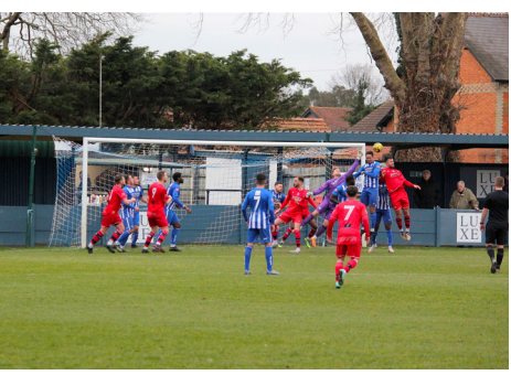
FULL TIME CHERTSEY TOWN 0-1 NORTHWOOD

However, brave Northwood deservedly weathered the storm and there were jubilant scenes at the end between players and supporters as Woods celebrated their third win in eight days.