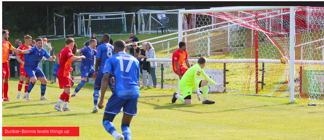
Dunbar-Bonnie levels things up

N orthwood lived to fight another day after they overcame a two-goal deficit to force a replay in the second meeting of these league rivals in six days at the newly named Iconic Stadium.