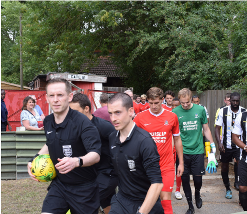
Classic 1 – The referee leads out the teams to start a new season