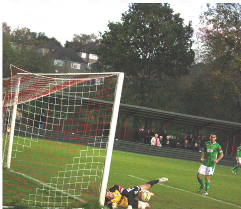
Classic 2 – Guernsey keeper Chris Tardif saves at the foot of the post