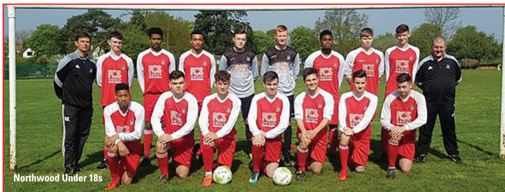
Northwood Under 18s